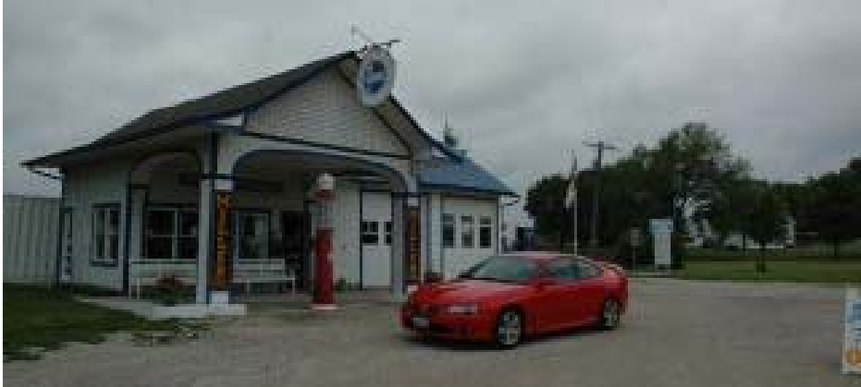
Cruising US 66 on Memorial Day in 2013. Parked at the nostalgic gas station in Odell, IL.

alone. I later told my father what was happening, and he said to tell the dealer to make them find me a car. I started to make some phone calls to Pontiac dealers in St. Louis and Chicago. When conversing with salespeople at these dealers, I was told that GTO's had arrived on their lots about a month ago. Here is where another flag was raised. I tried telling my salesman where I discovered some GTO's on dealer lots. I decided on other colors and encouraged him to call these dealers and try to do a 'trade'. He did not seem to work too hard with me in this area and later said he did not want to call Chicago dealerships. I was later informed by him that a Black model was being delivered to the Quincy dealership, and that car would be their 'floor model'. I was given first choice to buy that model if I wanted. I ordered a Metallic Blue car and was not going to give up on it. Since tracking down that particular Blue model was becoming difficult to find, I settled on some other colors. The next challenge was getting a fellow Pontiac dealer to cooperate in a 'trade'. Dealers contacted by my Quincy salesman either did not have the car delivered yet or would not part with it if it was actually there. After several phone calls, the Pontiac dealer in Jacksonville, IL finally decided to help us and let me have the their 'floor model'. It was a Torrid Red car. The