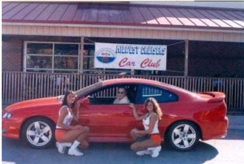
Attending a cruise-in with the Midwest Cruisers car club at Hooter's in Peoria, IL.

Now here is where the adventure begins. It was not as easy as it appeared. My parents also resided in Quincy and had a neighbor who was a car salesman at one of the local dealers. He actually helped me get my Chevy Blazer when I bought it in 1999. I asked him if he could assist me with getting the GTO. Since he was at the Chevy dealer, and this dealership dealt exclusively with that make, the salesman sent to the Pontiac dealer in Quincy to see one of his salesman buddies. I ventured over to the Pontiac dealer to see this salesman and told him that I wanted to get a GTO. He said he could order it for me. I chose the Metallic Blue color at the time and wanted an automatic transmission. I was then asked to provide a deposit, so I complied with his wishes. After getting the funds to the dealership, the waiting process began. I was hoping to have my car delivered to the car dealer showroom before Christmas. It would have been a nice gift to myself. I checked in at the